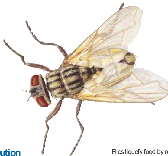
Common Housefly 14mm wingspan

Adults, 6mm long with 12mm wingspan; grey thorax with 3 longitudinal stripes, less pronounced than those of Common housefly; extensive yellow patch at base of abdomen; at rest, wings are folded along back; venation shows 4th vein extending straight to wing margin.