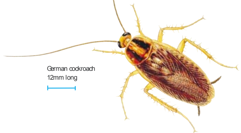
German cockroach 12mm long

Cockroaches and their faeces may cause allergic reactions especially amongst sensitive individuals eg asthmatics. Exposure may result from ingestion or through the inhalation of materials derived from cockroaches in airborne dust. In addition, food may be tainted with the characteristic smell of the cockroach, which is produced by faeces and salivary/abdominal gland secretions, or by the dead insects.