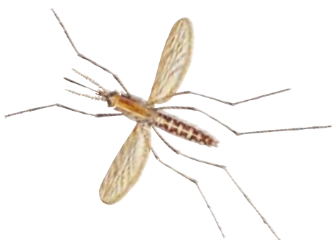
Mosquito. Aedes spp. 6.5mm wingspan

Primarily a seasonal biting nuisance in cooler climates but in the tropics they can also be major vectors of disease. They can transmit many diseases to both humans and animals, e.g. malaria, filariasis, yellow fever, encephalitis, and dengue fever. Only a few species of mosquitoes are implicated as vectors of human diseases. It is those which utilise humans as